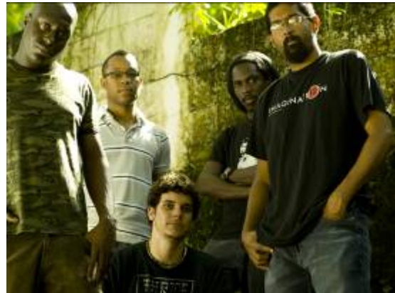
12 THE BAND

The ESC invites the public to what promises to be a truly dynamic concert. Tickets priced at $150 Special reserved and $100 General Admission are available at Cleve's One Stop Shop, Crosby's North and South and Emancipation Support Committee